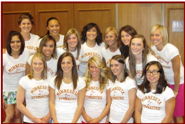
2011 Golden Gophers